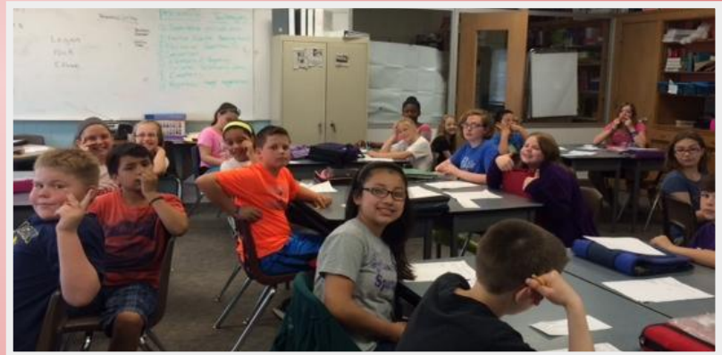
English Language Arts (ELA) and Social Studies Classroom