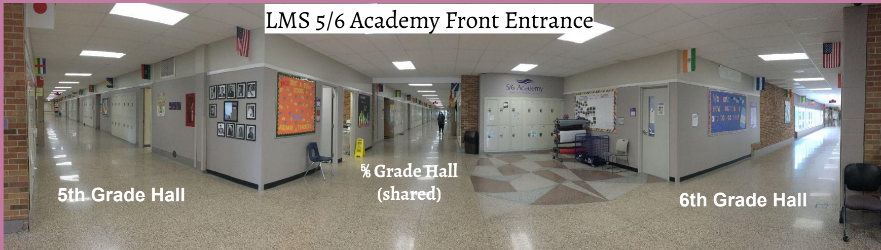
5th Grade Hall