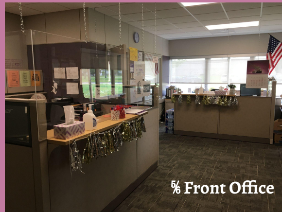
5 Front Office