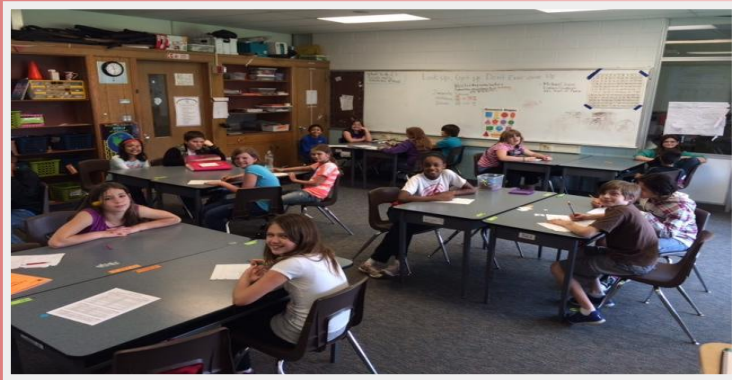
Math and Science Classroom