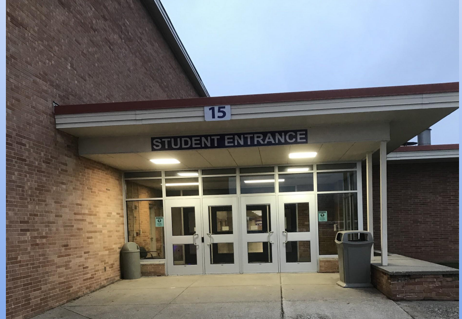
Left Side of School Building - Car Drop-off Door #15