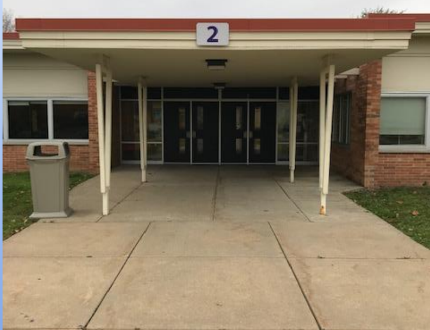
Front of School Building - Bus Riders Door #2